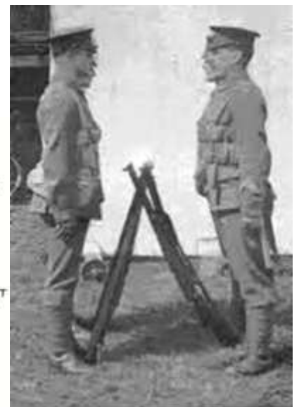
Piling swivel in use