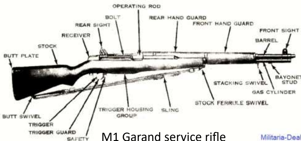
M1 Garand service rifle