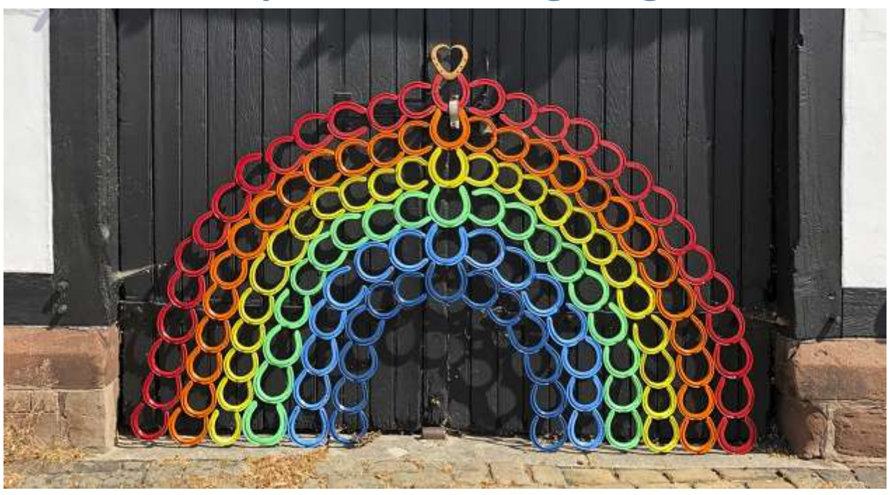
The NHS has received wonderful support for their unstinting devotion to caring for people and the village Smith showed his support for the NHS by making a rainbow from horseshoes and displaying it on his door.