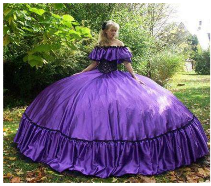
Ladies, the new Social Distancing outfits are available now...

A dog kennel supplier has called in the retrievers A company supplying paper for origami has folded. Interflora is pruning its business and Dyno-rod has gone down the drain.