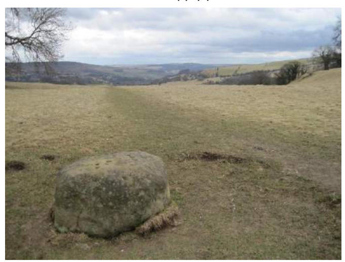
The Boundary Stone, Eyam, Derbyshire, with holes believed to be where coins were placed for trade during the quarantine of the Bubonic Plague outbreak of 1665-6.

Eyam: In 1665 a tailor from the Derbyshire village Eyam ordered a box of materials from London that he was to make into clothes. He unwittingly triggered a chain of events that led to 260 Eyam villagers dying from bubonic plague. The village elders quarantined their entire village to protect the surrounding area from the plague. This plan would have become an effectively self-imposed siege if it weren't for the villagers who lived around Eyam bringing provisions to them. Let us be thankful for those who supply provisions to us now.